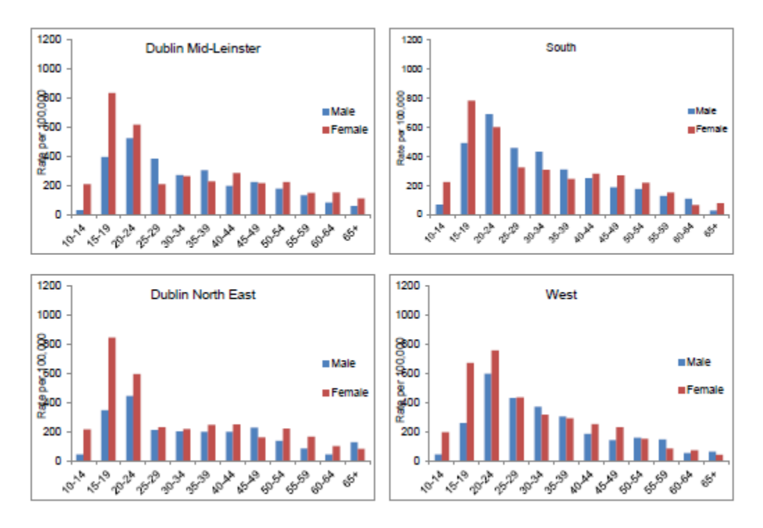
Figure 2: Age/sex-specific rate (per 100,000) of self-harm by HSE region

• The exceptions were among 10-14 year olds and 15-19 year olds where the female rate was 353% higher and 108% higher than the male rate, respectively.