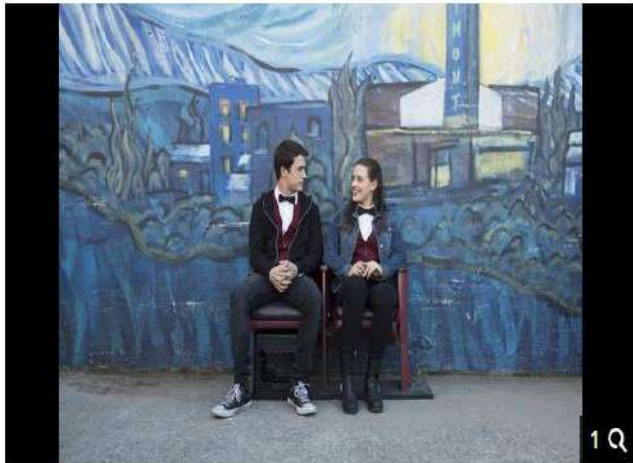
Dylan Minnette and Katherine Langford in 13 Reasons Why

Netflix officials defend 13 Reasons Why against claims it glamorises suicide